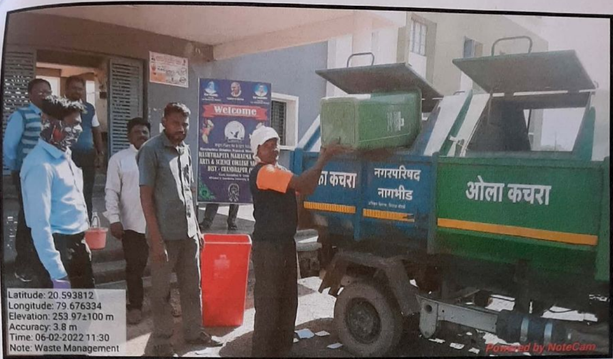
Solid Waste Management