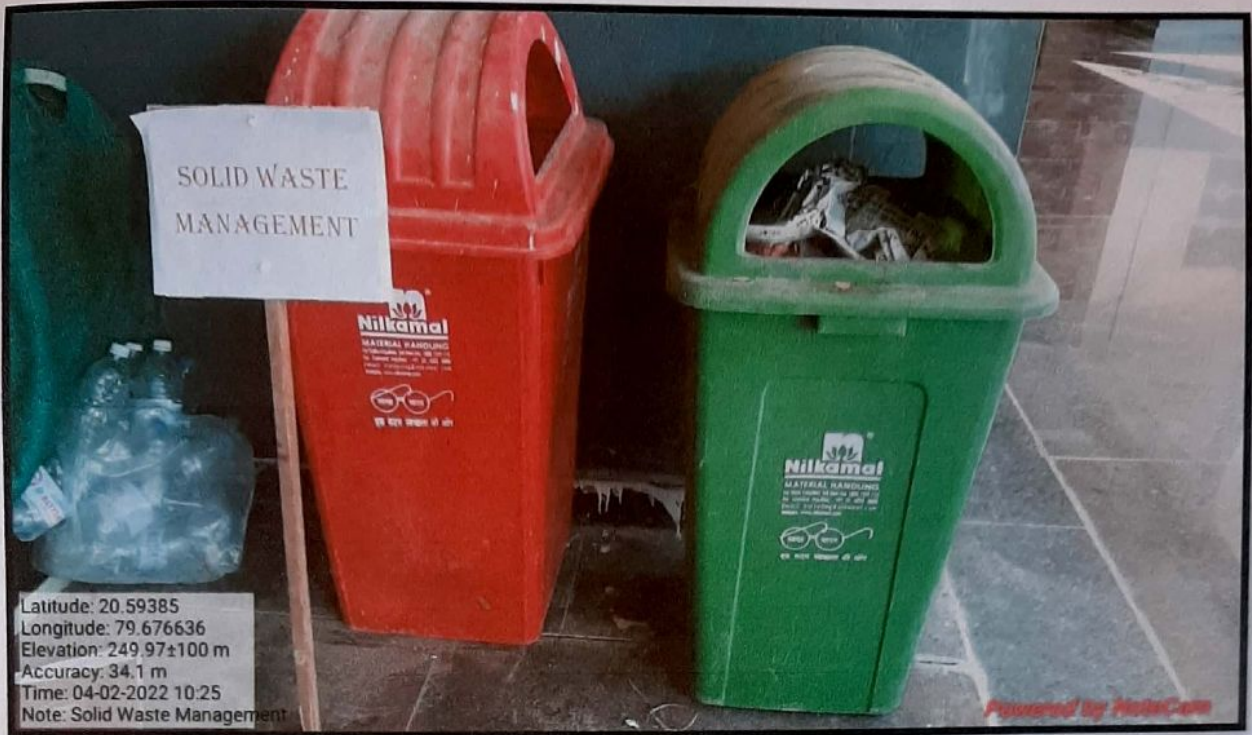
Dry and Wet Solid Waste