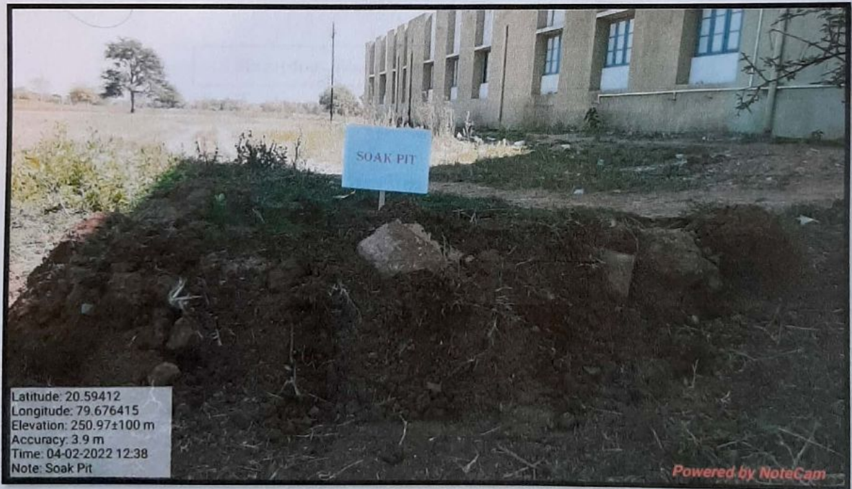
Liquid Waste Management