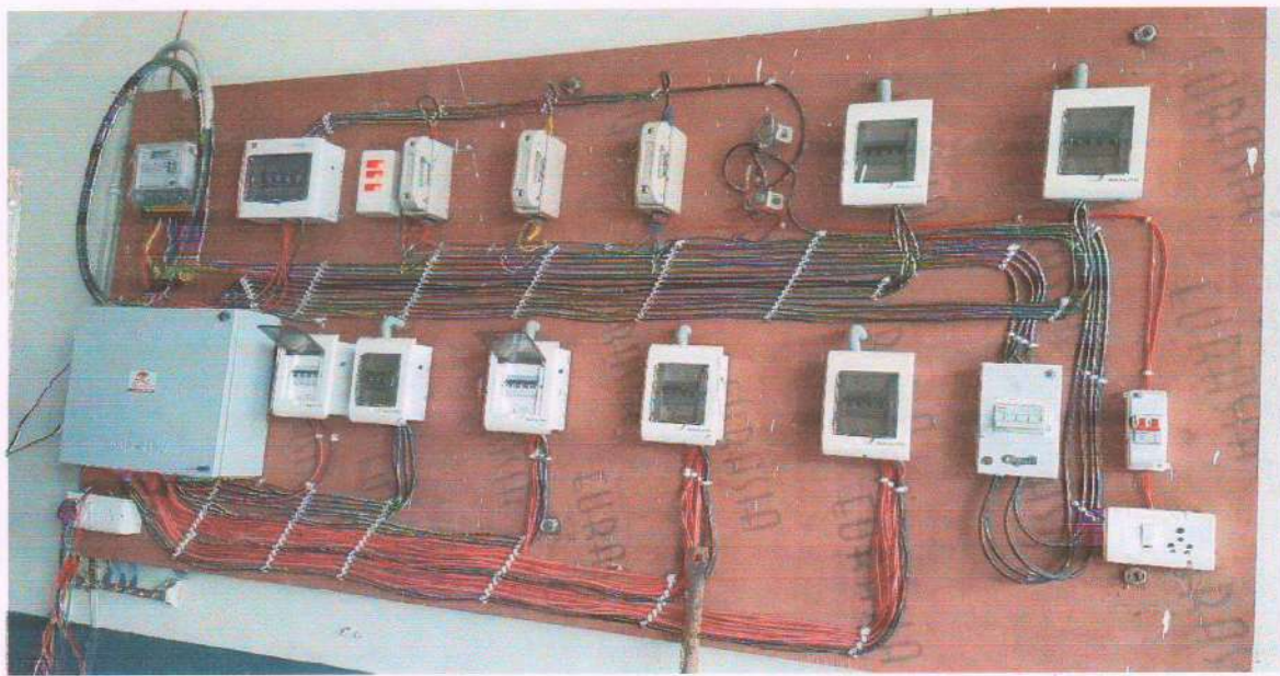
Fig.3 Energy Audit in Rashtrapita Mahatma Gandhi Arts & Science College, Nagbhid