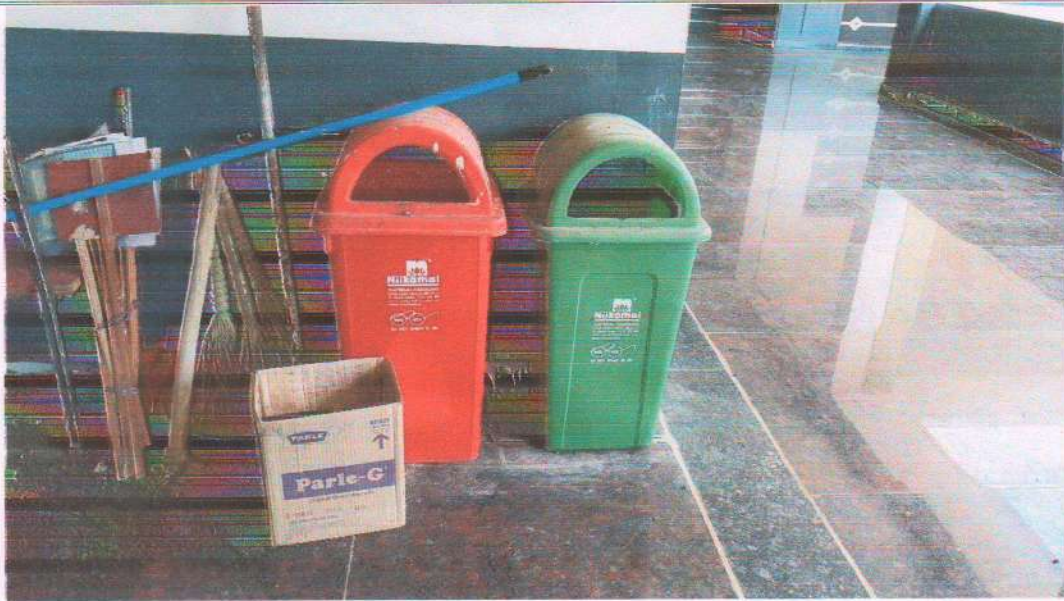
Fig.2 Dry & Wet Waste Collections bins