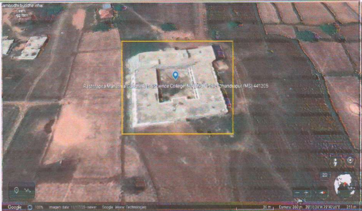
Fig.1 Location of Rashtrapita Mahatma Gandhi Arts & Science College, Nagbhid